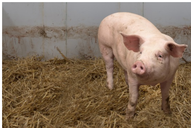
A. “Happy” pig in pen with straw bedding