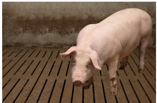
B. “Unhappy” pig in pen with slatted floor