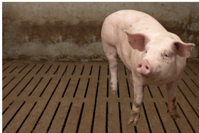
C. “Happy” pig in pen with slatted floor