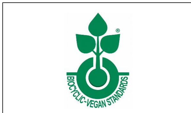
Figure 1. Biocyclic-vegan label