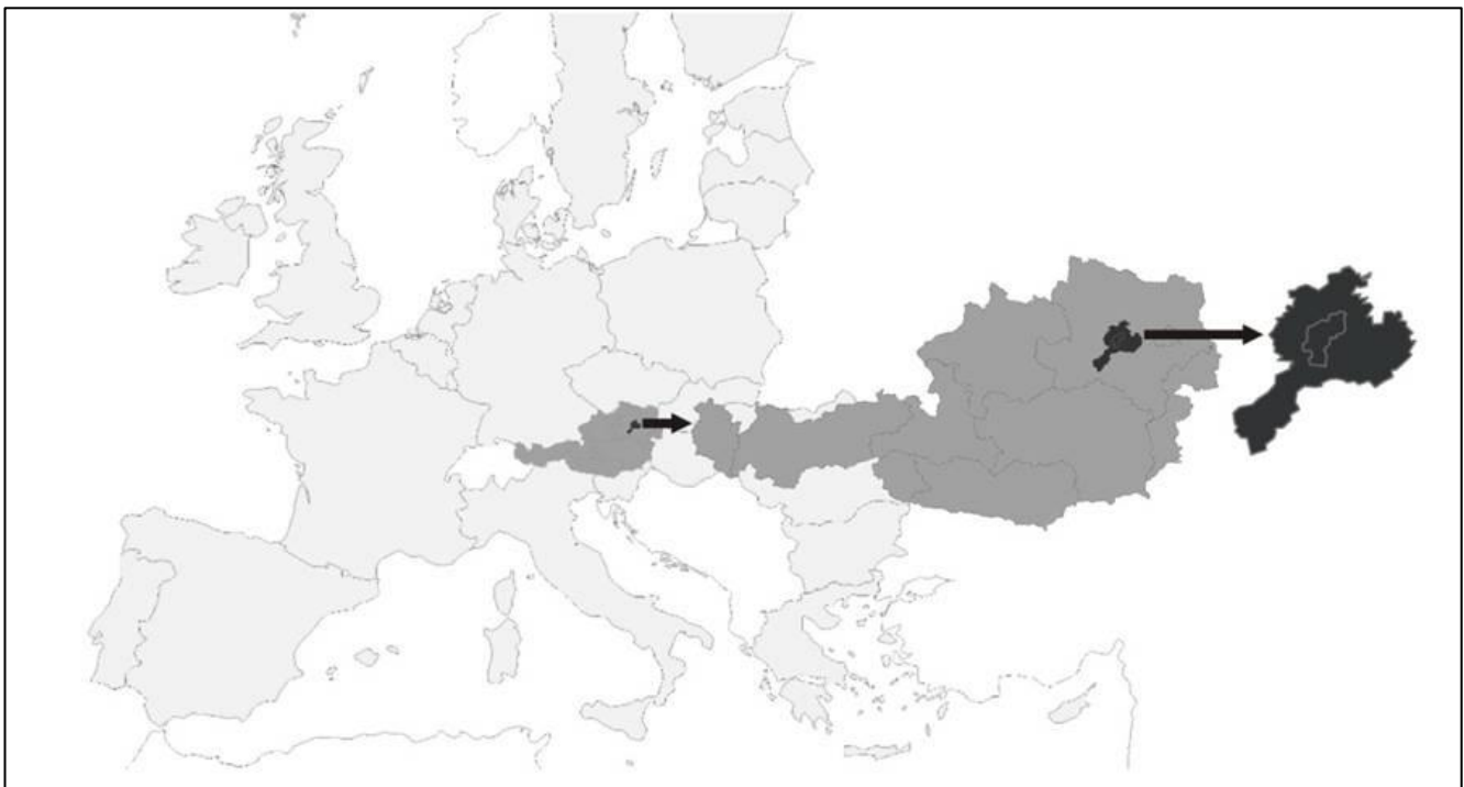
Figure 3. The survey area – the Austrian district of St. Poelten

At the time of the survey, all respondents were at least 45 years of age, which is important to consider farm succession. About 48% of these farmers indicated that they already had determined a farm successor.