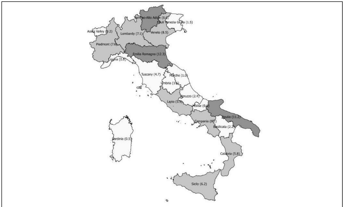
Figure A.1. Share of foreign workers by region in Italy (% on total foreign workers)

The Northern Regions, according to ISTAT classification are: Piedmont; Aosta Valley, Liguria, Lombardy, Trento and Bolzano (Trentino Alto Adige), Veneto, Friuli-Venezia Giulia, Emilia-Romagna. The Central regions are: Tuscany, Umbria, Marche, Lazio. The Southern regions are: Abruzzo, Molise, Campania, Apulia, Basilicata, Calabria, Sicily and Sardinia.