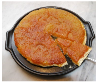
Multilateral metaphor