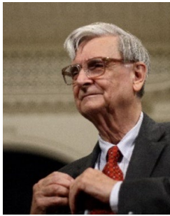
E.O. Wilson (1929-2021)