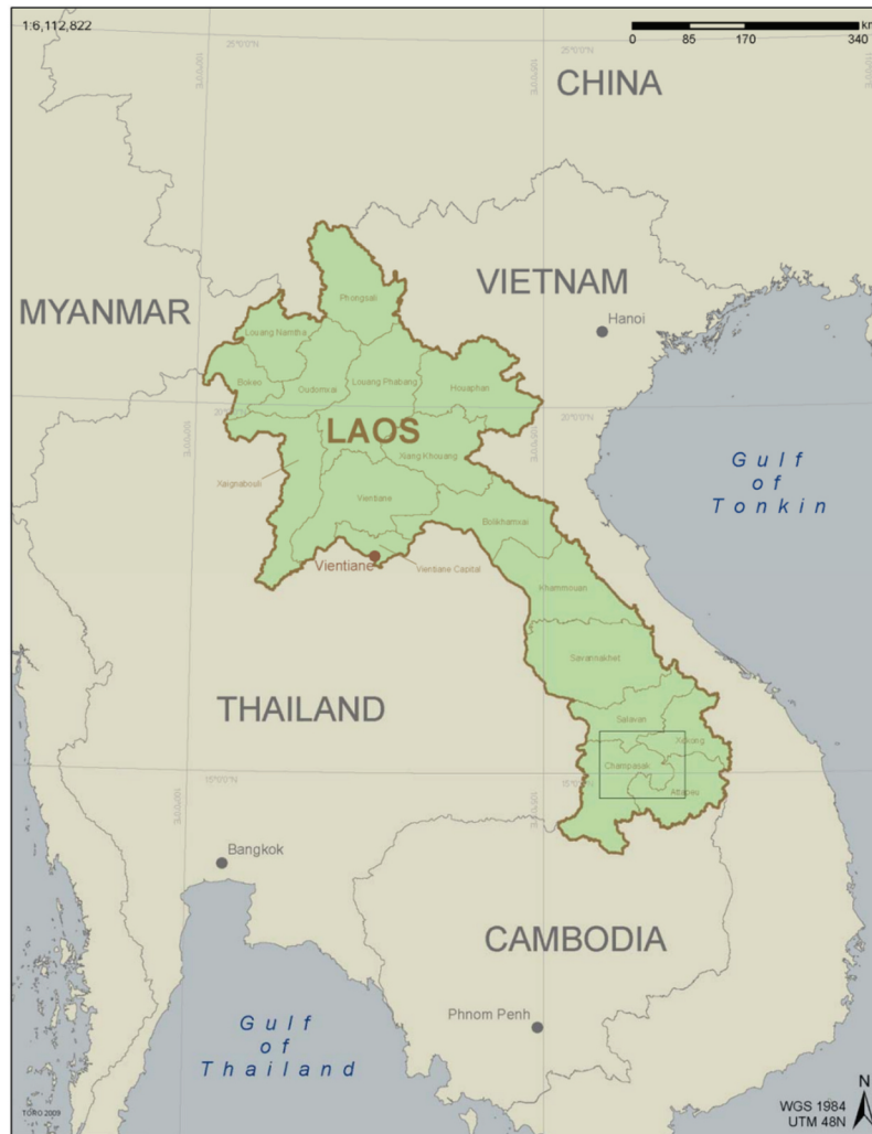
Figure 1. Map showing Laos and Southeast Asia. The coffee-producing areas in Laos is in southern Laos especially in Champasak Province source: Toro (2012).

Most coffee plantations during the French colonisation (1887–1945) were planted at a small scale, primarily for trials. In 1935, only 30,000 tonnes of coffee were exported to Vietnam. The coffee production area remained at <7,000 ha between the mid-1960s and the early 1980s during the Indochina war (Figure 2).