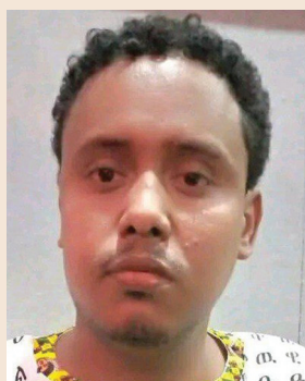
Million Adafre Bushashe

Abstract: This study aimed to investigate the effects of fiscal decentralization on Ethiopia's regional (Sub-national) macroeconomic stability. The study followed a causational research design employing data from 2005–to 2018. The units of analysis in the study are sub-national governments (SNGs). The study utilized the two-step System General Methods of Moment (SYS-GMM) model since it resolves econometric issues, including endogeneity, autocorrelation, and Heteroscedasticity. The study findings revealed that revenue and composite decentralization have significantly shielded macroeconomic instability. In contrast, expenditure and fiscal dependency are significantly aggravating macroeconomic instability. Among the control variables used in the study, regional economic growth and school enrollment significantly reduce macroeconomic instability; Foreign Direct Investment (FDI), population growth, unemployment rate, welfare, and public investment claimed the opposite effect on macroeconomic stability. The primary implication is