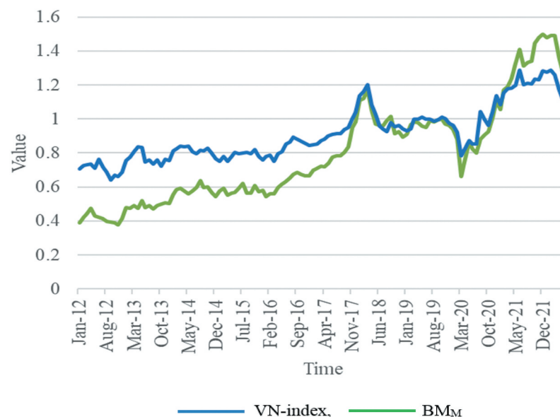
Figure 1. The VN-index point (divided by 1000) and the BM_M ratio for the market portfolio.

From 1/2012 to 6/2022, the VN-index and BM_M tend to increase, as shown in Figure 1. However, at the beginning of 2018, end of 2019, and end of 2022, the market volatility in these periods is very large. The HOSE market increased by 48% in 2017. The VN-index is ranked among the indexes with the most impressive gains globally. The “miracle story” of securities is expected by market participants to be continued in 2018. Therefore, assessment reports on the market outlook also lean towards possible VN-index, which continued double-digit growth to reach 1,120 and then even 1,250 points. Vietnam has become the stock market with the strongest increase in the world, ahead of Brazil, Russia, and Argentina, and nearly three times the increase of the NASDAQ index (National Association of Securities Dealers Automated Quotation System). However, the “hot rise”