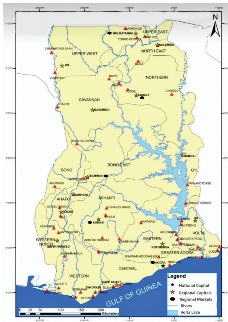
Figure 3. Map showing the regional markets where the study was conducted.

markets (GH¢ 23.5 each), with its lowest in the Bolgatanga market. Following the prices of domestically produced rice in Ghana, Techiman market recorded the lowest price of GH¢ 12.6 while Accra market had the highest price (GH¢ 17.2), see, Table 1 .