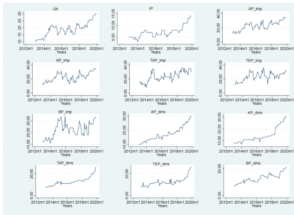
Figure 4. Price trend in various rice markets.

Figure 4 depicts the price trends of imported and domestically produced rice in the various markets in the given periods. The trend plots exhibited on the world market, Accra, Kumasi, Tamale, Techiman, and Bolgatanga show a similar pattern; that is these prices generally follows a steady increase (trending upwards) in the retail prices rice over time. Each market begins with prices being at their lowest for the start of January 2013 and gradually rising and falling. This can be associated with an increase in demand due to an increase in taste, income, and population over the years.