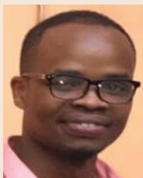
Safari Mulume Bonnke

Abstract: This article assesses the opinions of youth tomato growers on the accessibility of agricultural credit and factors that influence the accessibility in the Democratic Republic of the Congo (DRC). Data originated from a household survey for the 2019/2020 farming season. We interviewed 218 youth tomato growers from 6 horticulture production zones in the South-Kivu, eastern DRC. The result reveals a low rate of 20.6% on accessing agricultural credit among tomato growers. The topmost nature of agricultural credit received was cash-based, mostly from informal sources of finance (92.7%). The findings reveal that the lack of information on agricultural credit, the fear of credit default, and the absence of Microfinance Institutions in the study areas were the highest-ranking factors hindering tomato growers from accessing agricultural credit services. Our probit model shows that total household income, gender, and tomato growers' membership in a cooperative were essential factors that explain the probability of accessing agricultural credit. We recommend formalising the agricultural credit system by improving agri-finance extension service delivery to associations of tomato growers among the young to