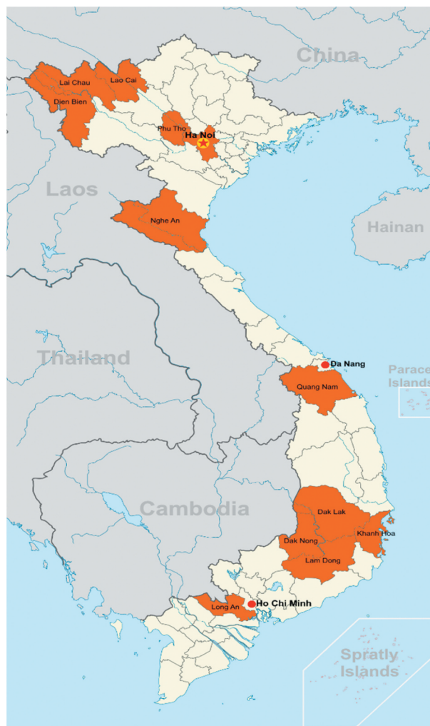
Figure 2. Site surveys. Source: Authors' creation.

households in 12 provinces, namely: Dak Lak, Dak Nong, Dien Bien, Ha Tay, Khanh Hoa, Lai Chau, Lam Dong, Lao Cai, Long An, Nghe An, Phu Tho, and Quang Nam (Figure 2). The VARHS covering these very same households had, by 2016 been carried out six times every two years. This is a high-quality panel data foundation for such a long period of nearly 15 years of study and policy work using the VARHS data. There were 2,131 households interviewed in all survey rounds over eight years. In this study, a balanced panel in 2008–2016 has been established and the number of panel households reduced to 1,534 because of missing data.