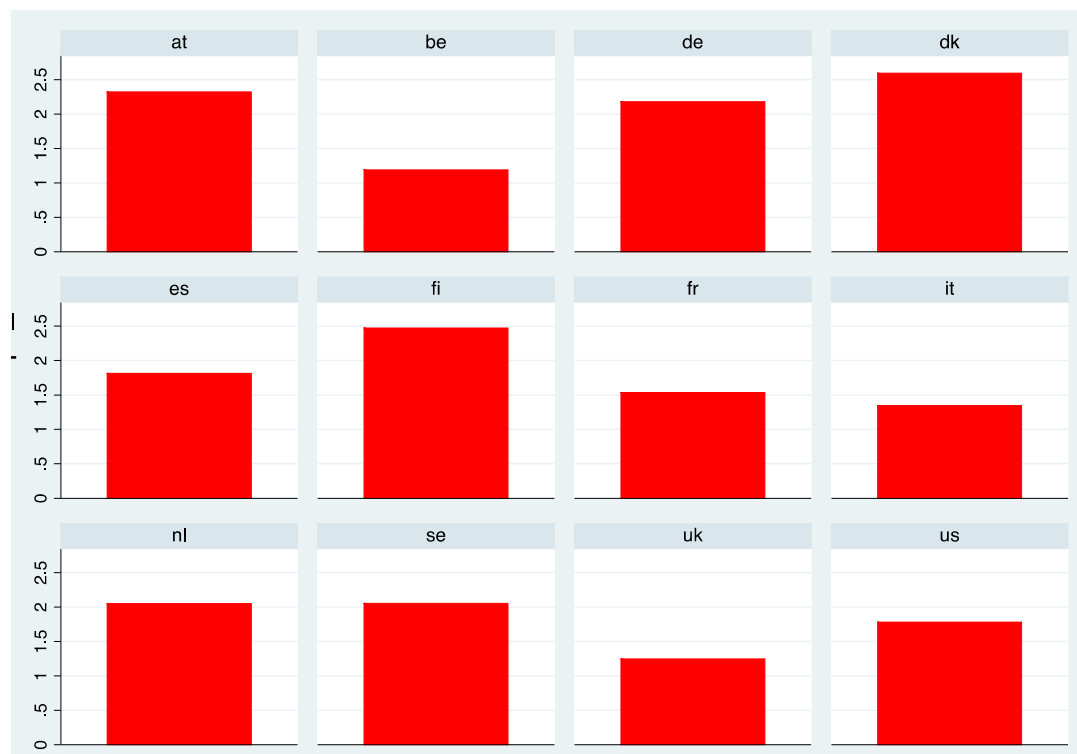
Chart 1. Environmental Policy Stringency Indicator (EPS)