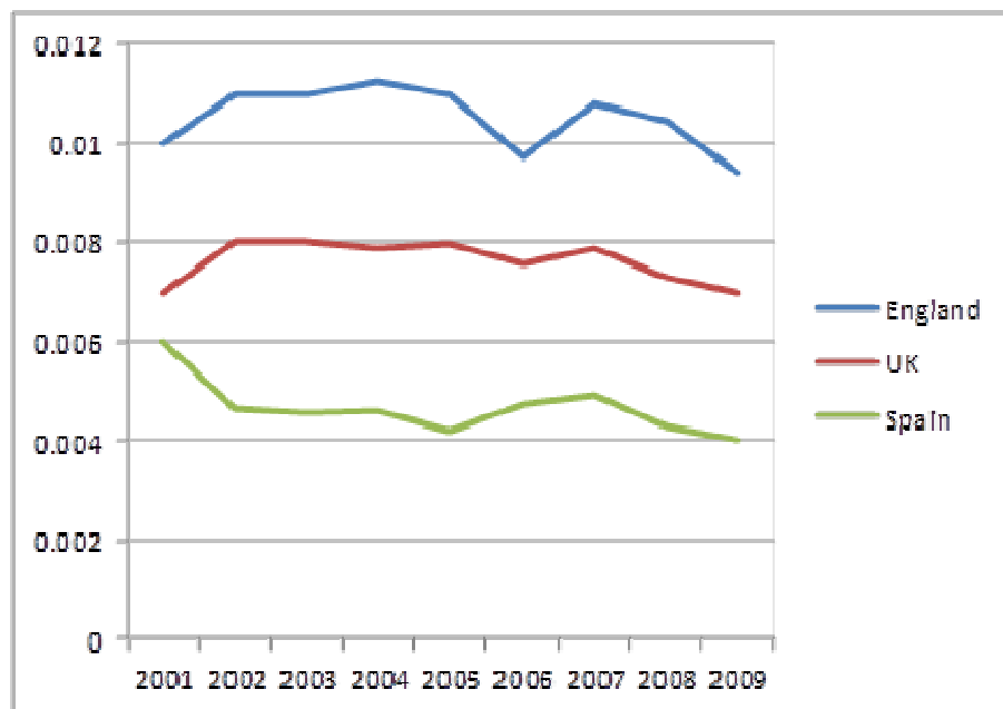
Figure 2. Regional Inequalities (unadjusted health care output)