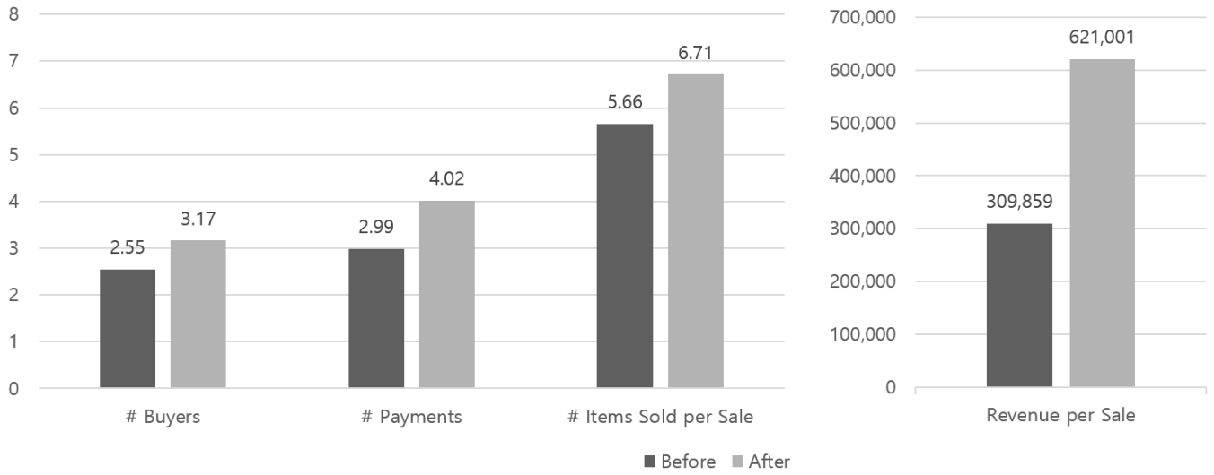
<Figure 2> Two-way ANOVA Result (Presence in Online and Offline Channels)