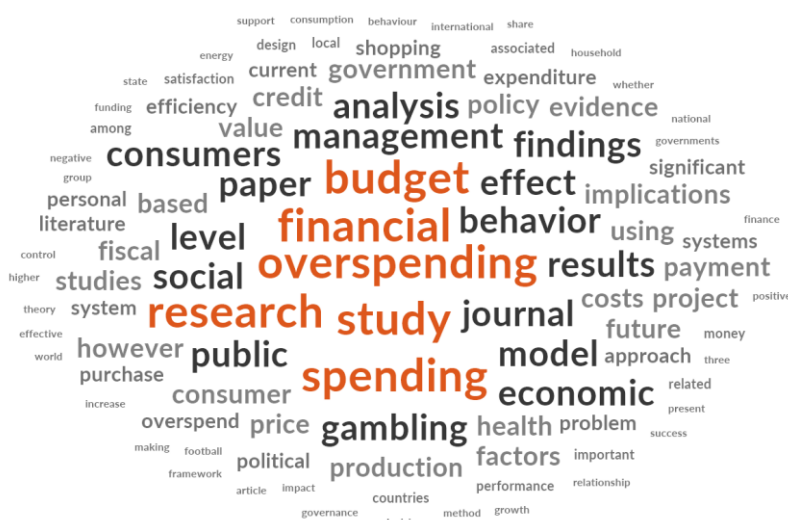
Figure 3 In-text analysis of overspending

Ariely and Kreisler (2017) offered a new perspective on analysing overspending. They analysed daily situations by gathering anecdotes and putting them on a general level so everybody could recognise himself while reading them. They presented the idea that we make wrong decisions because we are affected by our emotions, impulsivity, lack of long-term plans, self-deception, and the need to be adequate for the environment. Figure 3 presents an in-text analysis of overspending research.