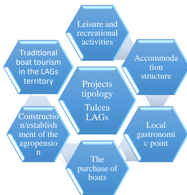
Figure 3. Projects typology in the tourist field

The typology of the projects is varied and we can note the development at a high level of business in the tourism field. For the most part, the projects are aimed at tourist reception structures, new constructions or modernizations and extensions of existing ones being supported. The financed accommodation structures are structures of the agro-pension, camping or guest rooms type, which combine the function of accommodation with agricultural, fishing or handicraft activities specific to the Danube Delta area. Tourists thus have the opportunity to get involved in the activities of the locals and discover the traditions and customs of the area.