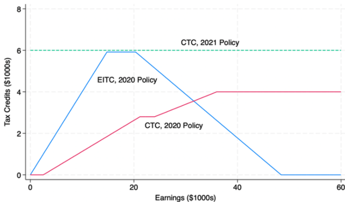
Figure 1. CTC and EITC for Married Parents with Two Children (Ages 6–16)

some portion of the phase-out range for EITC benefits before reaching the maximum benefits for two children of $4,000. For married parents, these benefits remain at the $4,000 level before starting to be phased out when joint earnings reach $400,000. The upward-sloping portion of the 2020 CTC policy would induce substitution effects that would tend to increase hours worked, while the flat portions are associated only with an income effect. An income effect is predicted to decrease hours worked but is generally expected to have a smaller distortionary effect than a policy with a substitution effect. The pro-employment incentive effects of the 2020 CTC are eliminated in the 2021 CTC, which would be expected to reduce employment (though the pro-employment impacts of the EITC remain).