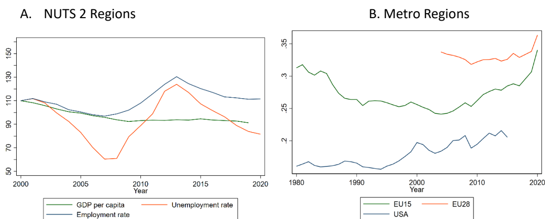
Figure 1: Evolution of Disparities