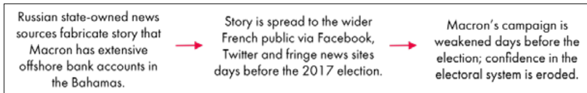
Figure 3: Russian Disinformation about French President Emmanuel Macron