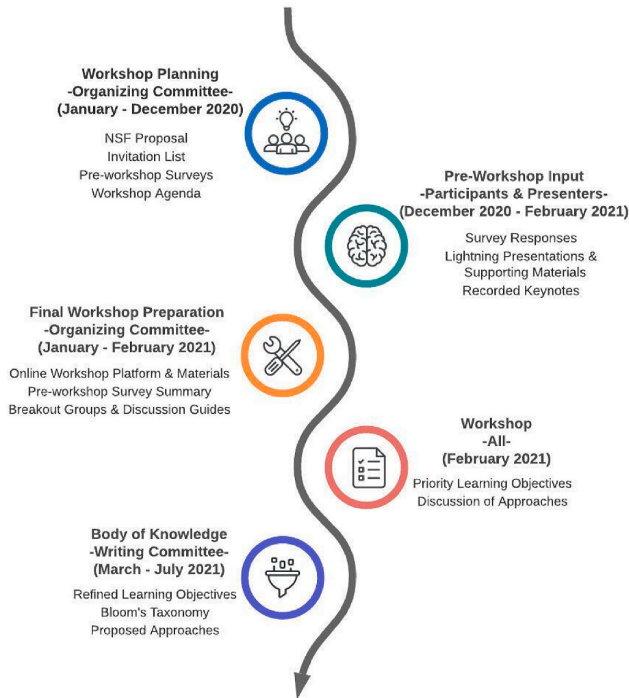
Fig. 1. Workshop timeline.

Global Engineering; (2) the most important skills for work in the global development sector; and (3) knowledge and skills missing from current graduate programs in Global Engineering. This input was summarized and shared with respondents for review before the workshop, to serve as a starting point for discussion.