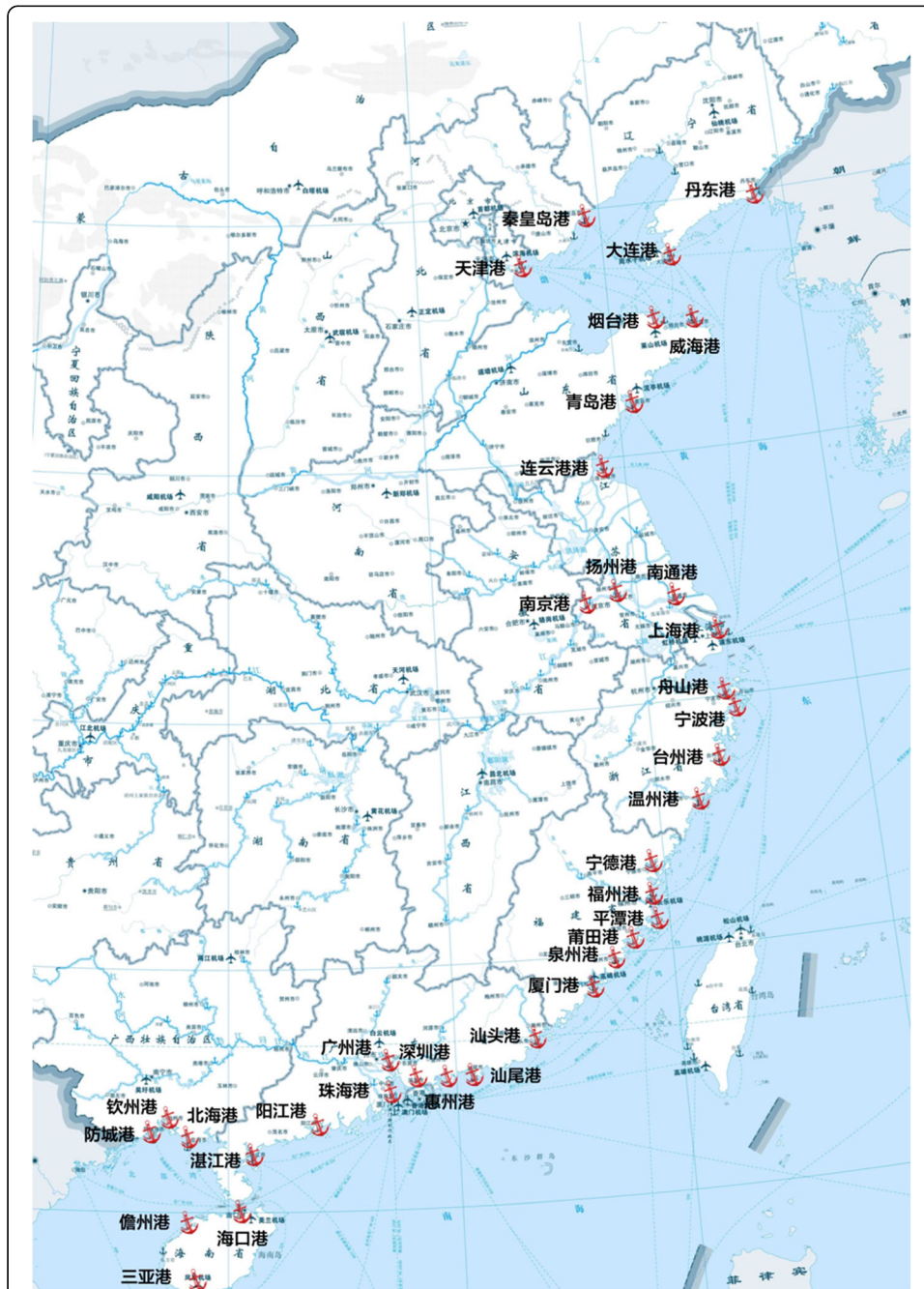
Fig. 2 The selected coastal cruise ports

cruise industry (Sun et al. 2019) with the remarkable increasing demand of cruising tourism and the strong inducement of economic, China has intensively concentrated on the construction and development of cruise ports. A comprehensive cruise port system is forming along the China coastline (Sun et al. 2014). After field investigation to ports and careful consideration to current state of each port, the paper focus on 38 coastal cruise ports along the China coastline such as Shanghai port, Guangzhou port, Tianjin port, Nanjing port, Qingdao port and Shenzhen port, just to name but a few, showed in Fig. 2.