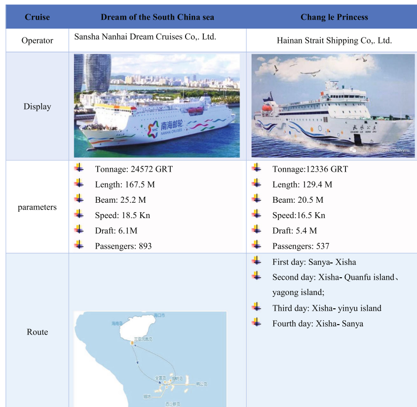
Table 2 Information about two domestic coastal cruises