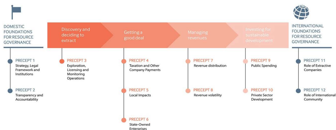
Figure 3: The natural resource charter decision chain

Source: NRG (2014). Figure reproduction here with permission from the Natural Resource Governance Institute.