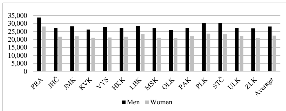
Fig. 1 Gross average salary per month in private sector (in CZK, Czech regions, 2017)