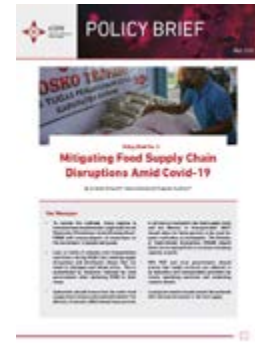
Mitigating Food Supply Chain Disruptions Amid Covid-19