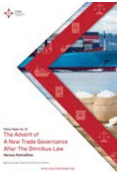
The Advent of A New Trade Governance After The Omnibus Law: Neraca Komoditas