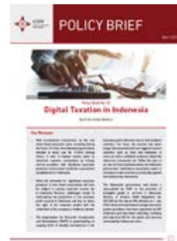
Digital Taxation in Indonesia

Go to our website to access more titles: