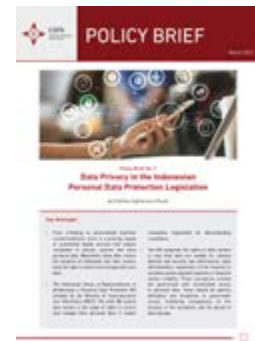
Data Privacy in the Indonesian Personal Data Protection Legislation