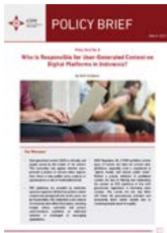
Who is Responsible for User-Generated Content on Digital Platforms in Indonesia?