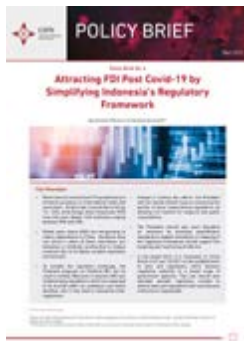
Attracting FDI Post Covid-19 by Simplifying Indonesia's Regulatory Framework