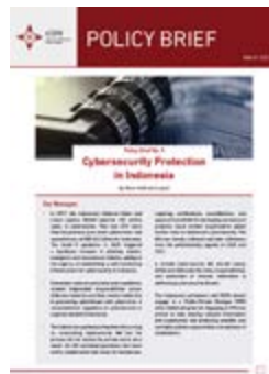
Cybersecurity Protection in Indonesia