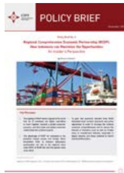
Regional Comprehensive Economic Partnership (RCEP): How Indonesia can Maximize the Opportunities An Insider's Perspective