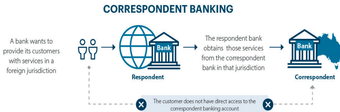
Figure 1 | Source : IMF Staff Discussion Note (2016) «The Withdrawal of Correspondent Banking Relationships: A Case for Policy Action», IMF, June.