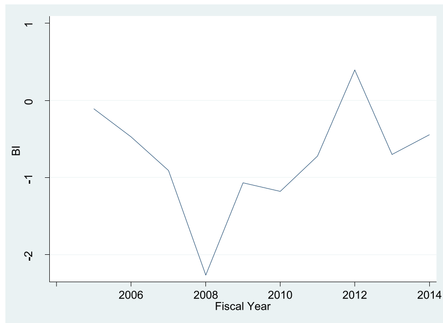
Fig. 3 Evolution of competition: Boone Indicator (BI)- (2005–2014)

The moderation test focuses on whether the causal relationship between social and financial performance changes due to competition. Model one represents the moderating effect of competition on the relationship between operational self-sufficiency and depth of outreach, M1. Model 2 estimates the moderating effect of competition on the relationship between operational self-sufficiency and breadth of outreach, M2.