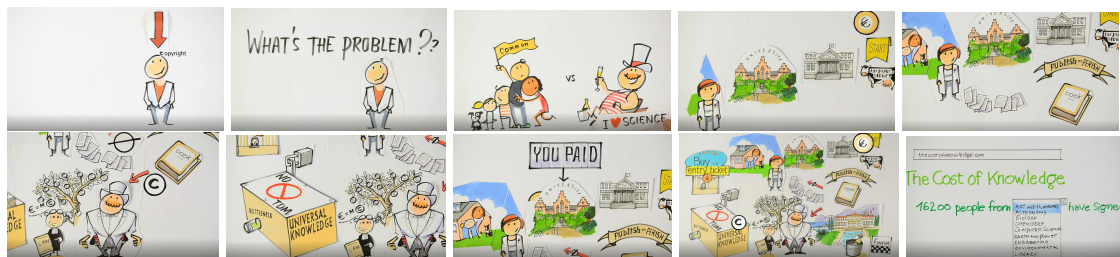
Figure A2: Video frames of the T_Activist Video

But, let's get back to data mining as a scientific publishers own the copyright to most of the knowledge contained in these Published before works, they consider how much access people get over their content. Including if you want to mine it, once you've paid for it. If you just want to read it with your eyes that's probably fine, but if you want to mine the data in this thing then, oh! well... Maybe we'll tell you which tools you can use, and it might cost you more to mine it than it would to read it, and that we might restrict how many pages that you can actually use algorithms on per-day. And maybe you can only read the text, and you can't look at the images and the charts. Honestly, complete control freaks! Now the EU copyright review urgently needs to curb this business of copyright that is smothering science. Copyright is a tool, not a goal! The goal is human knowledge and better access to this knowledge for everyone. In our next video, we'll talk about artists, industry, and copyright. The good, the bad, and the ugly. So subscribed, and don't miss out on the fun, and goodbye."