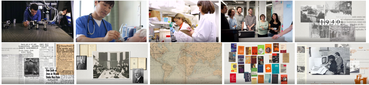
Figure A1: Video frames of the T_Publisher Video