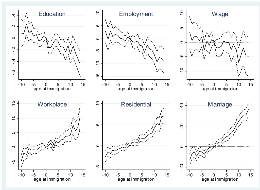
Figure 1 The relationship between age at migration and outcomes – semiparametric estimates

The slopes change when we turn to the social segregation measures in the second row of the figure. Workplace, neighborhood and marriage exposure all increase with age at migration. The relationship is particularly strong among the foreign-born, but also appears to be present among those born in Sweden. This suggests that there is inheritance in the integration process; the “capital” (broadly defined) acquired by parents before the child is born seems to reduce segregation among their children.