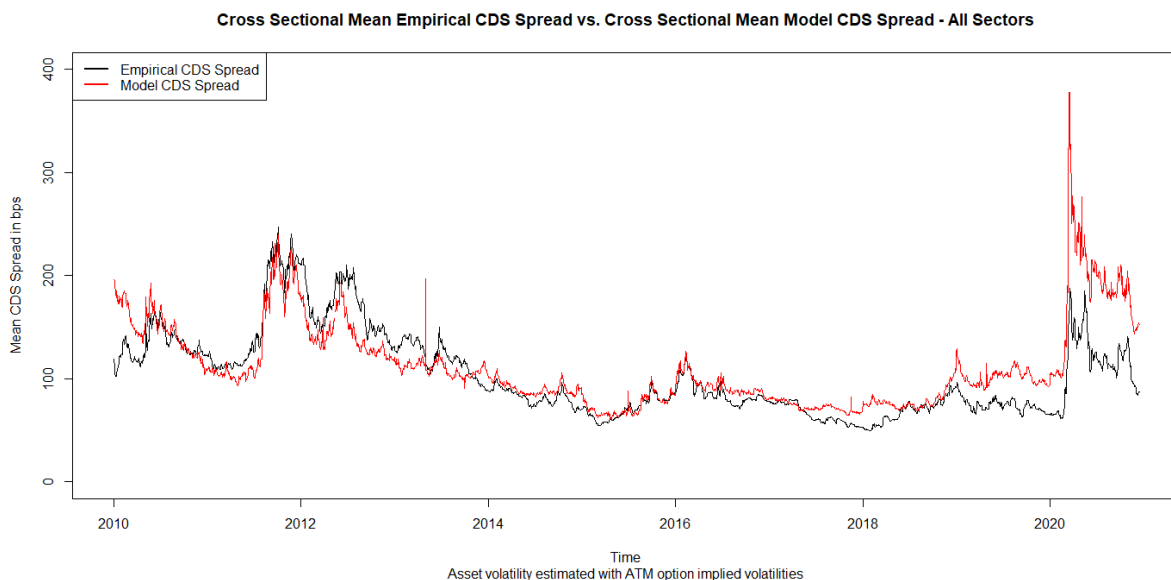
Figure 3: Estimated mean cross-sectional CDS spread for all sectors using the CG model with an asset volatility estimator of one year at-the-money option implied volatility.

table 3 panel A depicts each intrasector correlation estimated with Person product-moment coefficients and panel B depicts the Spearman rank coefficients. For all sectors, except for Energy in its both specifications and technology in its implied volatility specification, the full period exhibits strong correlation between market and model spreads. Values range from 0.546 for the option-implied CG model spreads for the sector consumer non-cyclicals, to 0.814 for the option-implied CG model spreads for the sector utilities.