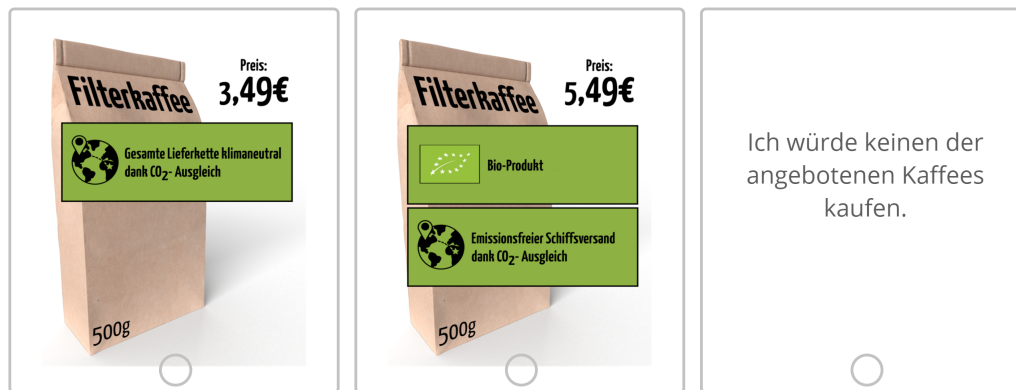
Figure 1: Depiction of a Survey Choice Set (Two Profiles & No Buy Option)

Würden Sie eine der folgenden Packungen Filterkaffee (500g - gemahlen) zum angegebenen Preis kaufen? Wenn nicht, wählen Sie bitte „Ich würde keinen der angebotenen Kaffees kaufen“ aus.