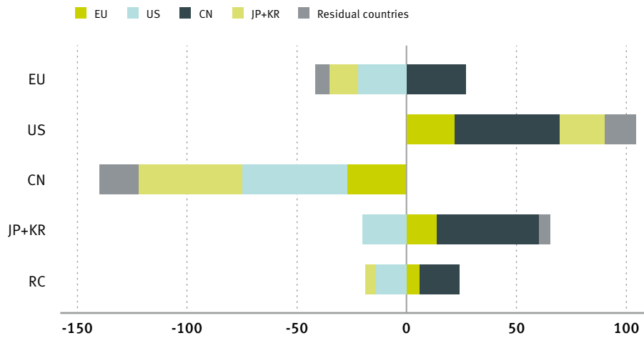
FIGURE 2: STACKED BILATERAL INFLUENCE (2012 – 2017)

For each focal geographic area the bar shows the bilateral influence of that area with respect to the other four areas. 0 refers to reciprocity between the focal area and all other areas, 100 refers to full independence, and -100 refers to full dependence.