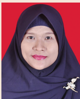
Maylia Pramono Sari

Abstract: This study analyses the relationship between sustainability performance, convention signatures, sustainability offices, sustainability research, teaching programs, student clubs, financial statements, and the extent of sustainability reporting in higher education institutions (HEIs). The sample of this study was 153 unit of analysis of 57 HEIs which are registered in the Global Reporting Initiative database during the period 2010–2020. Descriptive, content, and multivariate regression analysis were used to analyze the data and test the hypotheses. The level of sustainability performance, convention signatures, sustainability offices, sustainability research, teaching programs, student clubs, financial statements have a significant effect on the extent of sustainability reporting. Moreover, the random effect model is the best approach for estimating the model. The study contributes to a better understanding of the determinants of HEIs sustainability reporting. Several