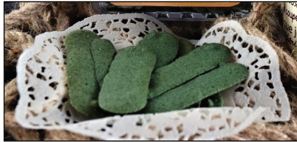
Figure 2. New cookies enriched with spirulina.

The scale used in this study was a 7-point numerical rating scale (Cooper & Schindler, 2014) ranging from 1 to 7, with the anchors being “do not like at all” to “like very much”, “bad” to “good”, “strongly disagree” to “strongly agree” for each attribute and “not at all likely” to “extremely likely” regarding purchase intention. The prototypical product is shown in Figure 2.