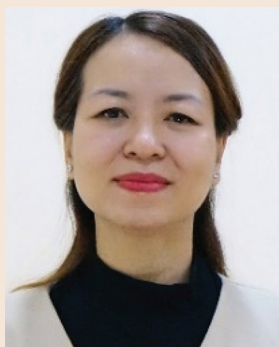
Tang My Sang

Commercial banks have an important role, so they always receive the attention of stakeholders such as customers, employees, and community (Diaconu & Oanea, 2015). These institutions are the main source of capital mobilization and distribution for most economies in the world