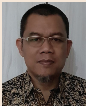
Ramel Yanuarta RE

Abstract: This study examines the effect of household interference on business returns and household economic welfare of Micro and Small Enterprises (MSEs). This study employs a quantile regression method involving 7,020 households as the sample. The data are taken from the Indonesian Family Life Survey (IFLS) in two waves (2007 and 2014) to show the returns on microbusinesses. Variables such as unpaid workers, direct consumption of business revenue, and home-based businesses affect profits and household expenditures per capita. This study shows an overlap between MSEs and household business activities in emerging economies. This is contrary to most previous studies on MSEs that have separated businesses and households, thus MSEs' performance could not be properly defined and analyzed. Besides, most Indonesian government policies and efforts only address business activities driven by opportunity, and few accommodate business activities