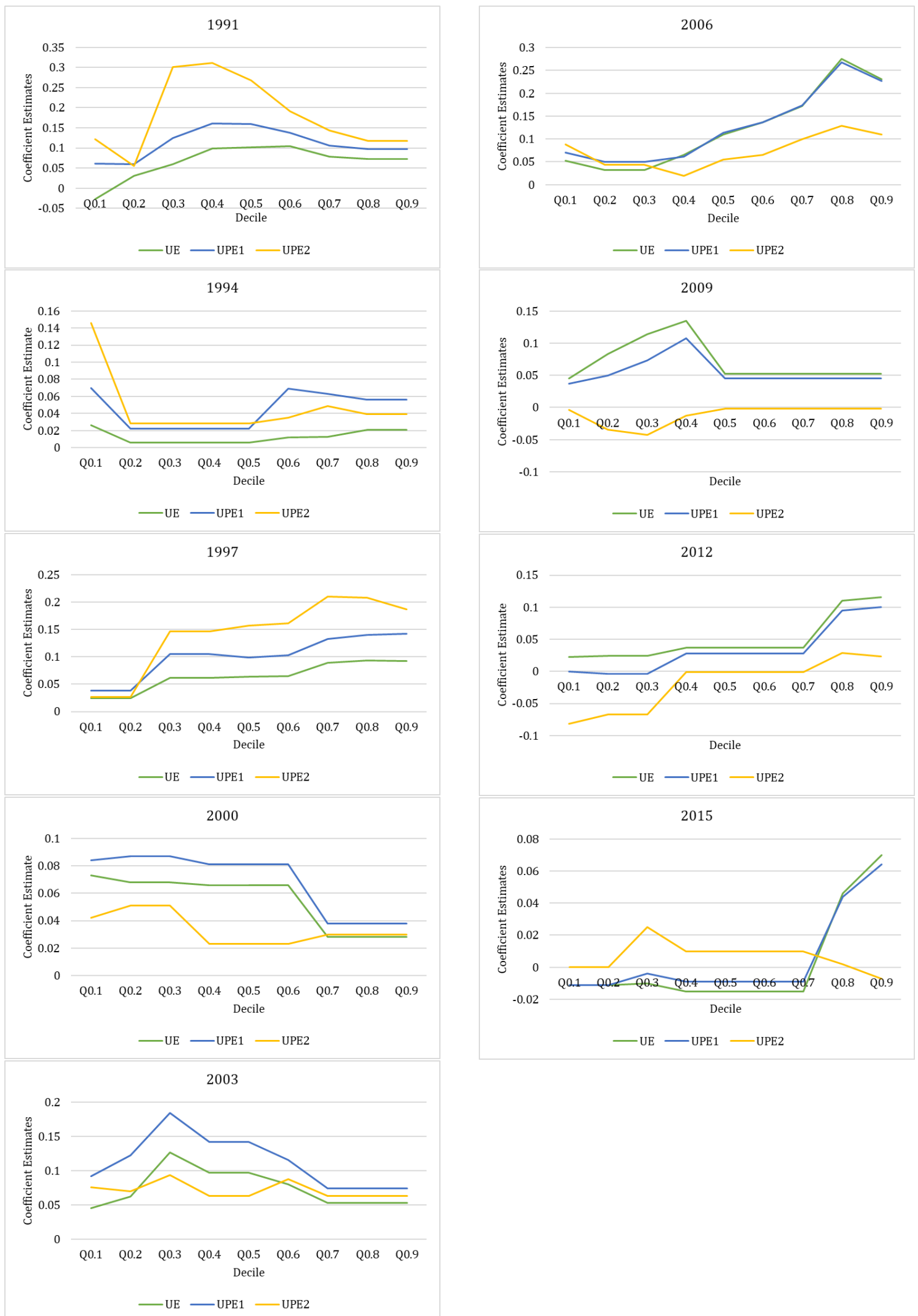
Fig. 2 The Returns to Education-Unconditional Quantile Regression (UQR)-UE, UPE1, UPE2