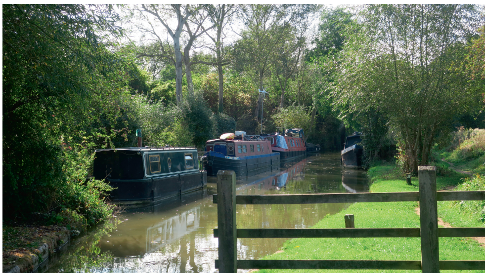
FIGURE 3 An informal mooring

Despite the increased interest of the city council and parts of the community in residential moorings, many boaters, either by necessity or by preference, decide to stick to informal arrangements. Unlike continuous cruisers, they remain in a specific spot for years. While they are often deprived of immediate access to services, their cost of living is lower than in a formalized context. Such settlements either need to remain hidden (Harris, 2018; Gurran et al. , 2021) or as unobtrusive as possible (see Figure 3). The ability to stay put depends not only on the visibility of boats but also on the capacity to identify locations where authorities are not entitled or interested in monitoring boaters. In this context, the solution also depends on informal support and community know-how. A boater staying on the River Thames described such support in the following way: