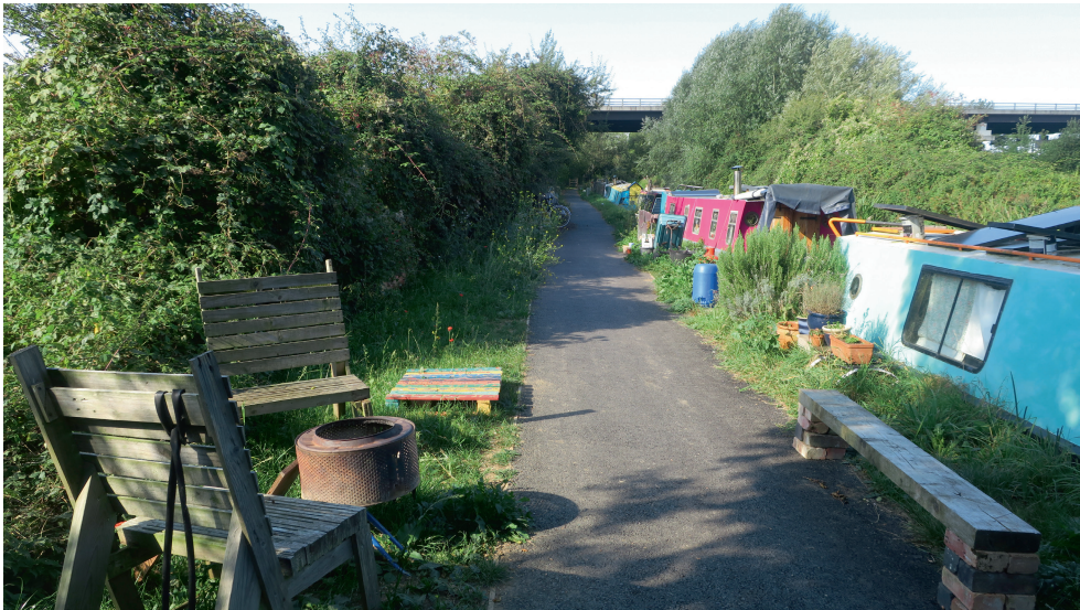
FIGURE 2 The Agenda 21 mooring (photo by the author, September 2021)

really wanted to persecute them ... people didn't want to move on all the time. So it was a bit of a stalemate, I suppose' (interview 20, expert/boater). As a result, an 'amnesty' for people residing at the site was announced. In this specific instance, related to the Rio Earth Summit in 1992, a relatively supportive approach on the part of the city and efforts by community members made it possible for the mooring to be established. As an outcome of the co-produced process, a set of governing regulations were created to reflect the main principles essential for the community, including low ecological impact and security of tenure.