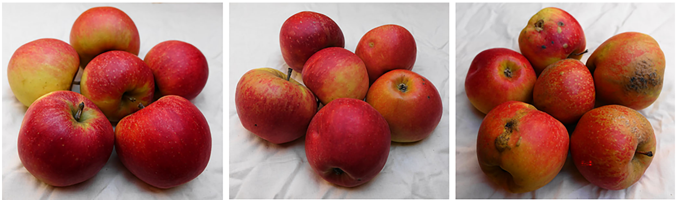
FIGURE 1 Elstar apples with different external qualities as shown in questionnaire. Left: flawless apples, middle: slight imperfections, right: heavy imperfections.