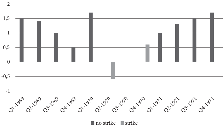
Figure 1: Quarterly Growth of Real GDP per Capita 1

So, the bank strike was not a national disaster. On this point about everyone agrees. For instance, the Central Bank of Ireland (1971) states: