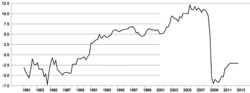
Figure 2: Time-varying Long-run Coefficient

Note: The graph provides the evolution of the error correction coefficient over time