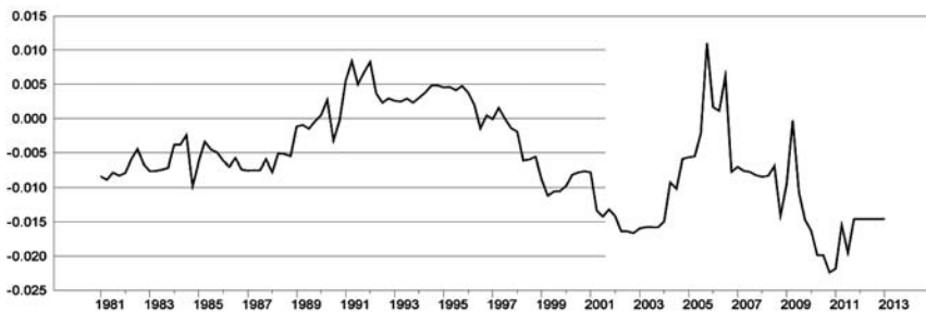
Figure 3: Time-varying Error Correction Coefficient

Note: The graph provides the evolution of the short-run coefficient for the exchange rate over time