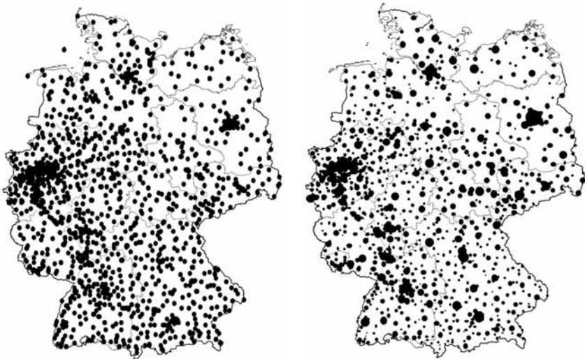
Figure 2: German hospital distribution Figure 3: German hospital bed distribution

In 2006 the total number of hospitals in Germany has been 2,061. Altogether, they controlled 509,134 hospital beds (StBA, 2008). According to our product market definition, we had to eliminate 402 hospitals from our sample and hence consider 1,659 hospitals that control 463,201 beds. The geographic distribution of the hospitals and of hospital beds considered in the analysis is shown in Figure 2 and Figure 3.