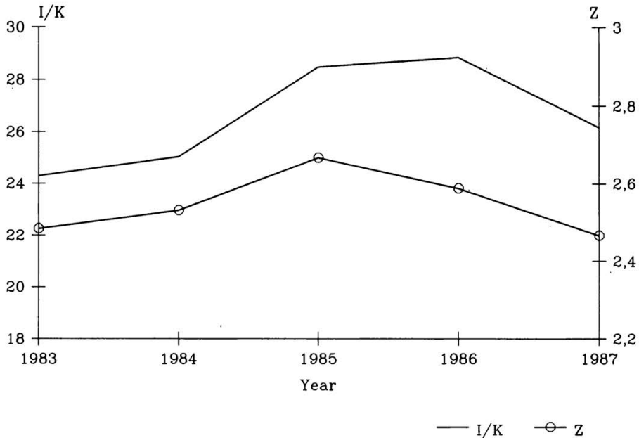
Figure IV: Time-Series Development of ( I/K ) and Z

The two scatter diagrams illustrate the relationship between the investment rate ( I/K ) and Q or Z . Each point represents a value pair of one company. The values pairs contain five-year averages of investments and Q 's or Z 's. Tobin's Q theory lets us expect the pattern in Figure I, which exhibits strong positive correlation between investment expenses and Q . Clearly, as can be seen in figure II, investments and Altman's Z -score variable are also positively correlated. 12 Figure III and IV are the time series complements to figure I and II. They contain weighted ( I/K ), Q and Z averages for each sample year. 13 It is apparent that ( I/K ) and Q run parallel, while there seems to be a one period lag between ( I/K ) and Z .