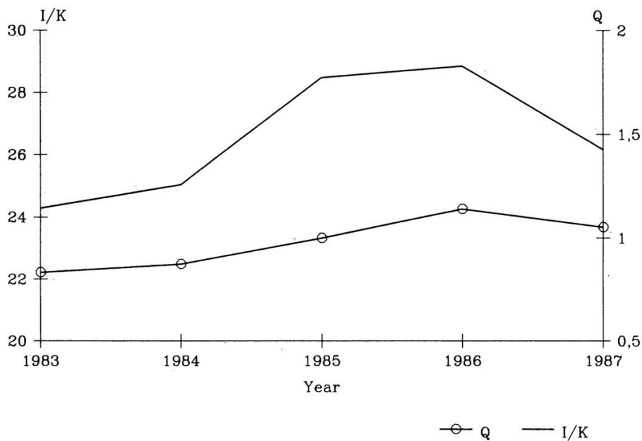
Figure III: Time Series Development of ( I/K ) and Q