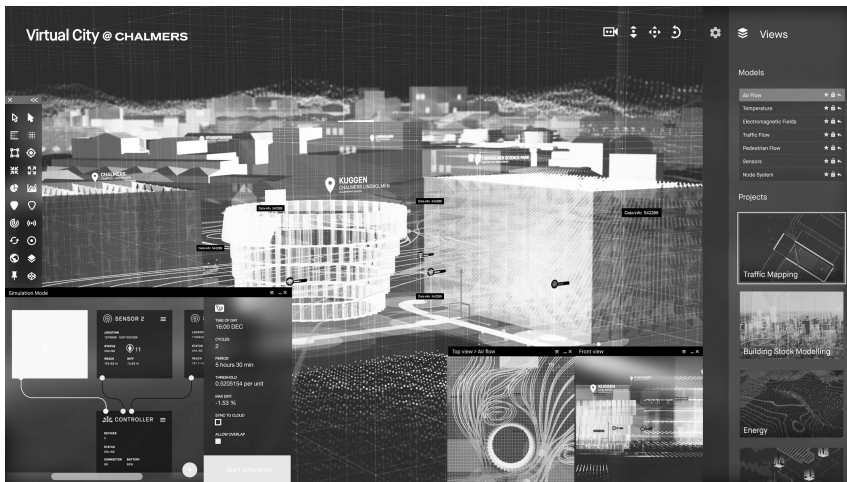
Image 8.4 Illustration from the Digital Twin Cities Centre at Chalmers University of Technology, Gothenburg, Sweden.

Source: Digital Twin Cities Centre, Chalmers University of Technology.