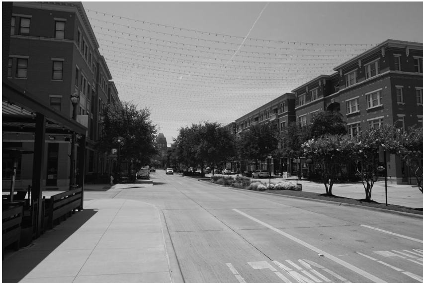
Image 4.3 Coleman Boulevard, Frisco, Texas, USA.