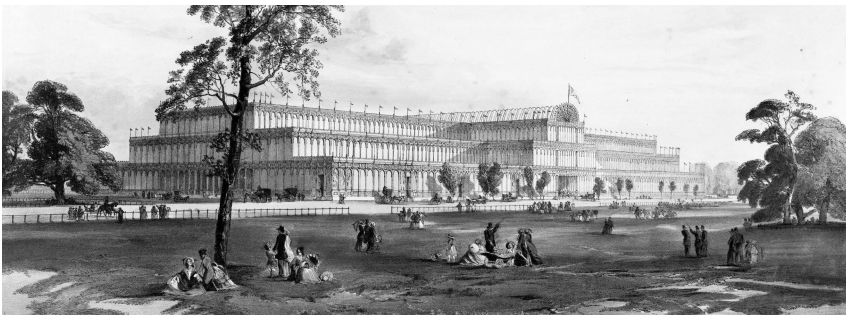
Image 7.1 The Crystal Palace in London, during the Great Exhibition of 1852.

In no doubt, the global cities of today have been given a more prominent role in the global economy inasmuch that economic growth is more often than not centred on urbanised regions and cities. As mentioned in Chapter 1: Introduction , roughly 55% of the world’s population, or 4.2 billion people, live