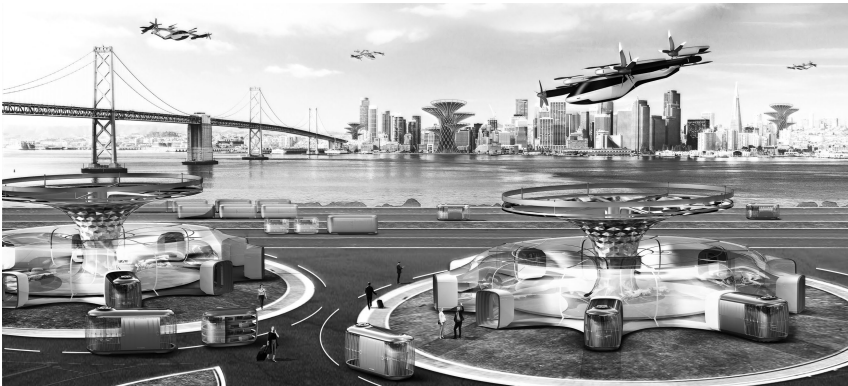
Image 5.2 Flying car concept art by Hyundai and Uber.