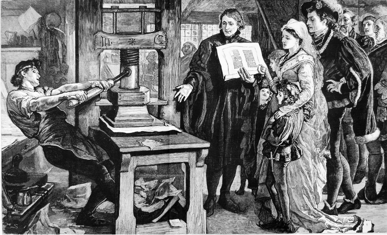
Image 8.2 William Caxton showing his printer to King Edward IV and the Queen in 1877.

Source: oldprint.com, Wikimedia Commons.