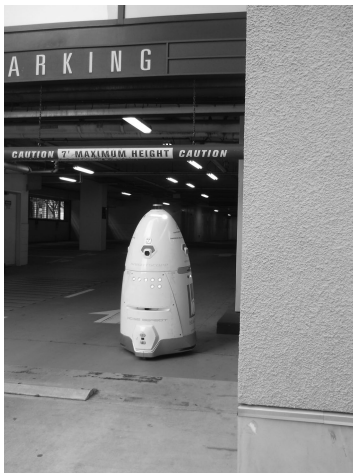
Image 9.1 The Knightscope K5 security robot patrolling a parking garage.

The K5 model was chiefly developed for the purposes of patrolling malls, parking lots and neighbourhoods (Mishra, Goya, & Elngar, 2020). However, more advanced models capable of considerably faster speeds and more suitable for terrain use, such as the K7 model, are currently in development (Knightscope, 2022c; Orage Forlag, 2020). Of course, there are many other similar products abound as well. In many instances, the mere presence of such autobots may act as deterrents, following the concept presented by English