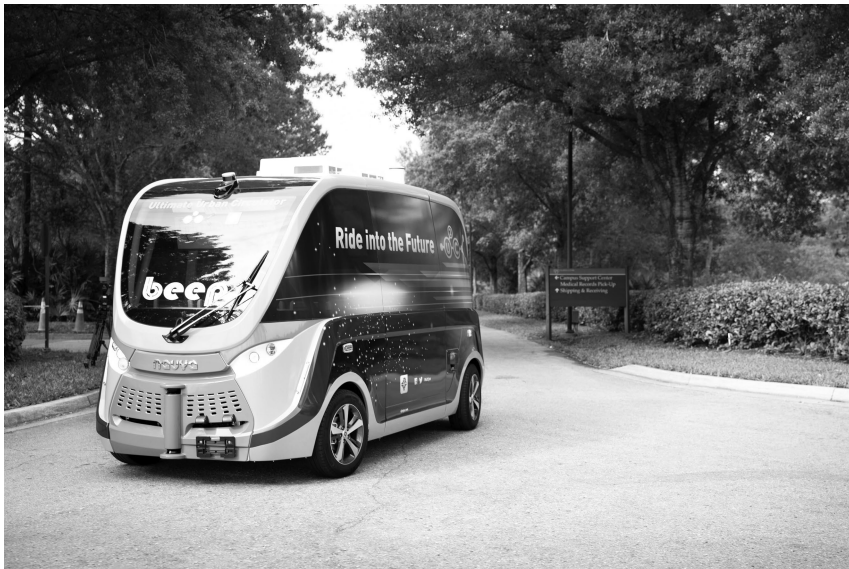
Image 8.3 An autonomous bus transporting COVID-19 test samples at the Mayo Clinic, Florida, USA.

In this way, autonomous technology has a wide array of uses, and once implemented, they may well become permanent even once the pandemic subsides. The same can also be anticipated among various types of consumer behaviours. Unwilling to handle potentially virus contaminated money bills