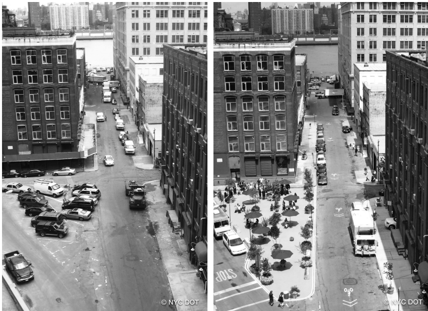
Image 2.2 Pearl Street, Brooklyn, New York City, before and after retrofit.

In Rotterdam, the Netherlands, and San Francisco, USA, public spaces, e.g. parking spaces, walkways and plazas, were converted into commercial retail spaces so that businesses that were severely affected by the pandemic would be able to serve their customers in a safer manner (Fracassa, 2020; Serhan, 2020). Toronto, Canada and New York City, USA installed “social-distancing circles” in their parks in order to prevent overcrowding (Feinstein, 2020; Harrouk, 2020; Serhan, 2020). Dining habits across many cities also changed during the pandemic, with many cities imposing restrictions on the number of people allowed per table, how to serve food, etc. Outdoor dining, or “alfresco dining” became more popular (Clark & Brown, 2021). Also, there was a surge of so-called streeteries in many cities (Combs & Pardo, 2021). These are essentially spaces set up by restaurants looking to serve customers while following social distancing regulations, and may, in some cases, even expand their outdoor seating by using spaces previously dedicated to other purposes, such as pavements, parking spots or even the street itself.