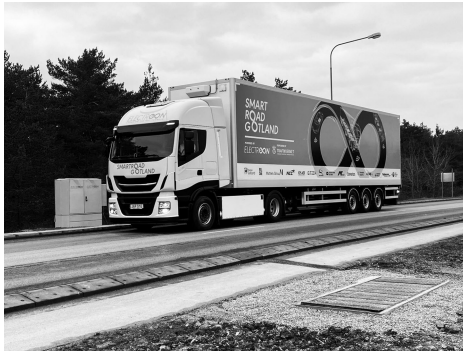
Image 5.1 Smart road system in Gotland, Sweden.

and traffic signals (Toh et al., 2020). Naturally, the accrued energy may also be stored or distributed to the electric power grid. This technology has the potential of changing the future of energy production. On these roads, photovoltaic modules could be placed directly on top of road surfaces in order to capture sunlight. The energy generated could also be used to illuminate street dividers during the dark hours and for melting ice and snow during the cold seasons. One example is the “Smartroad Gotland” project located on the Swedish island of Gotland. Smartroad Gotland is a 1.6 km long wireless electric road charging system that is able to charge electric cars while driving (Hájnik, Harantová, & Kalašová, 2021).