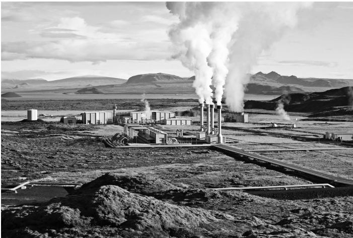
Image 10.1 Nesjavellir, the second largest geothermal power station in Iceland, located in the city of Thingvellir.

An even more articulated example is Kenya, which is set to secure a majority (51%) of its electricity from geothermal power in the coming decade