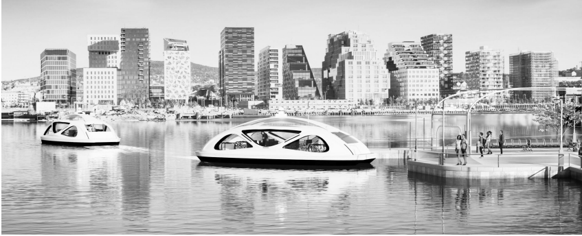
Image 5.3 Autonomous passenger ferries as envisioned for future operations.