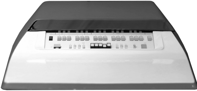
Image 4.1 The Honeywell H316 “kitchen computer” from the late 1960s.

One must also not neglect the economic impact and incentive brought forth in constructing smart homes and buildings. For instance, it is anticipated that the market for smart buildings will register a global compound annual growth rate (CAGR) at 12.6% throughout the period 2021–2027 (360 Research Report, 2021). Factors that are propelling the growth are increasing energy concerns and increased government initiatives on smart infrastructure projects.