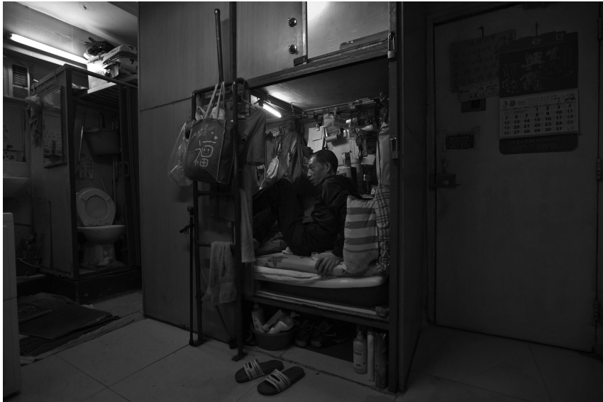
Image 4.2 A 63-year old man sitting in his “coffin home” in Hong Kong. The dwelling measures at 3x6 feet and is priced at HK$2,400 (US$310) a month. It houses the man’s sleeping bag, a small colour television set and an electric fan, among other items.

Housing insecurity has been a clear and present problem among low-income earners for a long time. For instance, as of 2019, more than 10 million households spent more than half their income on rent (Joint Center for Housing Studies of Harvard University, 2020). Following the COVID-19 pandemic, households in the US with an income lower than US$30,000 per annum began experiencing the highest rate of job loss and the slowest rate of recovery, with millions of families falling behind on their rent, which, in turn, led to the accumulation of debts they were not able to pay (Schuetz, 2021). A consequence of the pandemic was therefore for many low-income earners to double-up with their families or friends, thus living in crowded homes that increase the risk of spreading the pandemic further (Schuetz, 2021). This is in addition to other previously known health risks associated with crowded living, such as infectious disease and mental health problems