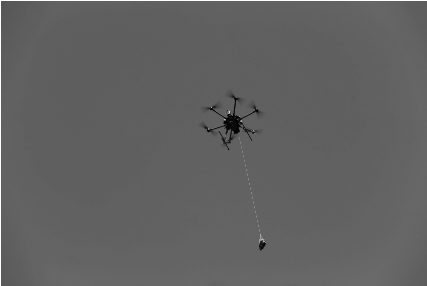
Figure 3.4 Drone with an automated external defibrillator (AED) on the way to a person suffering cardiac arrest.