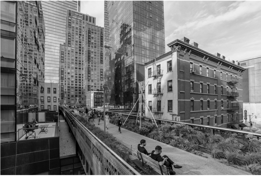
Image 2.3 High Line, Manhattan, New York City. An example of green landscape redesign of obsolete infrastructure into green, vibrant public spaces.