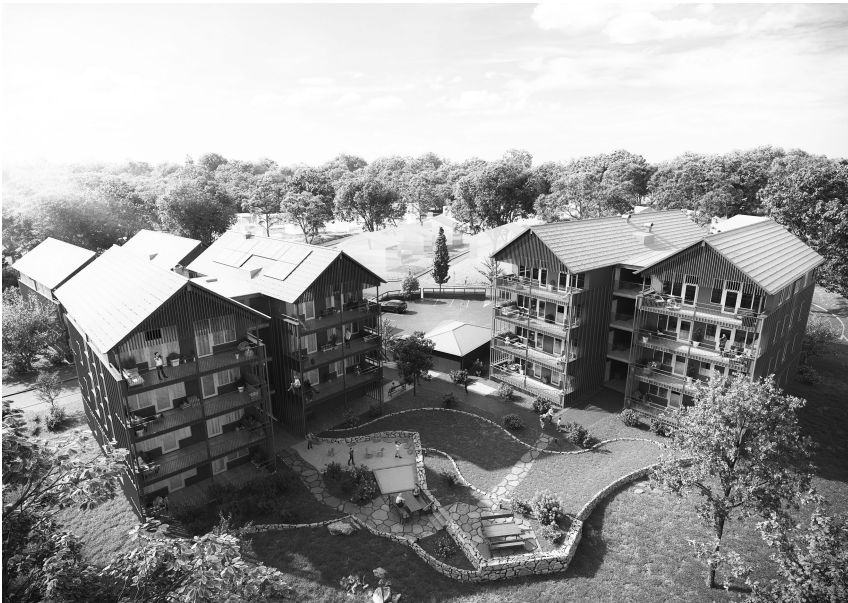
Image 2.1 Residential complex of Ramselyckan , located in Öjersjö, outside Gothenburg, Sweden. The complex features wooden features, large windows and large ground surroundings.

Thus, smart cities will need to be diverse in their design (Harrison, 2017). While quality work–life balance a proximity to a varied assortment of amenities will play a huge role in where Millennials (and possibly also Generation Z) relocate, a number of these factors are also contingent on age. For instance, students and childless young professionals would tend to look for more “hip” environments, such as nightlife options and travel capabilities to a greater extent than other categories of people. As these people start families, their priorities tend to shift towards ensuring housing affordability, where they would tend to favour living in “calmer” and more eco-friendly neighbourhoods, while also emphasising the need for public services centring on childcare, education, healthcare etc. (Auslander, 1997; Karamujic, 2015). For instance in 2022, the urban area of Öjersjö, located northeast of Gothenburg, Sweden, built 8 four-storey houses with 81 residential units in a complex called Ramselyckan . The complex featured wooden siding, large windows and large grounds surroundings, while also being supported by geothermal and solar heating in order to make the project more energy-efficient (Oslo Børs, 2021).