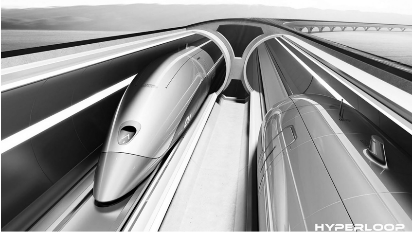
Image 5.5 Concept art depicting the Hyperloop.

Source: Neuhausengroup, Creative Commons.