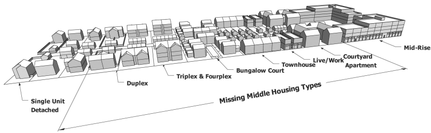
Image 4.4 Illustration of the missing middle housing.