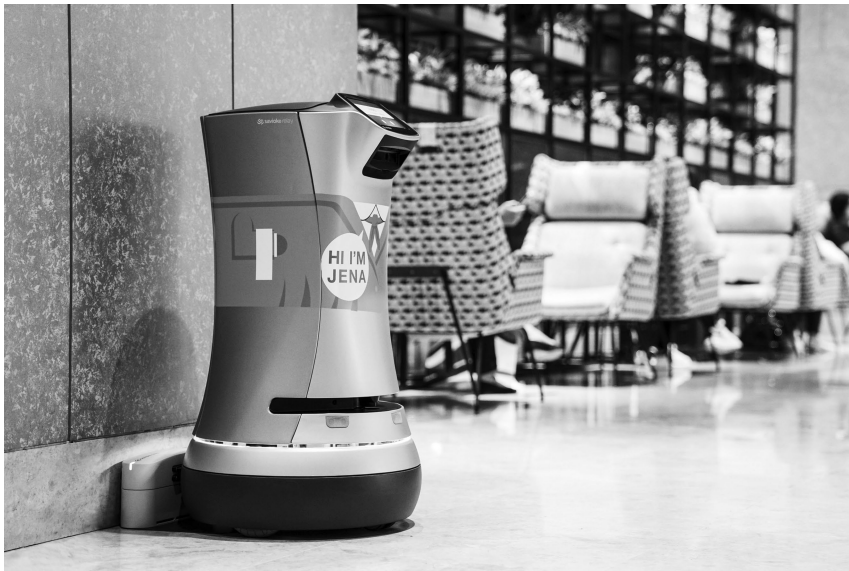
Figure 3.2 Jena, the hotel delivery robot.

With advances in sensors and increasing robot dexterity, and an increased pandemic awareness, more high-precision tasks will undoubtedly become candidates for substitution and one can expect to see more developments rolled out in different cities within the next decade or so, with one prime candidate being manufacturing tasks in the electronics sector (Van der Zande et al.,