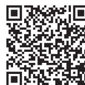
Figure 23.1 QR code referring to interactive exercises.

Access interactive exercises for this chapter 157 by positioning your smartphone camera at the dot-filled box, also known as a QR code.