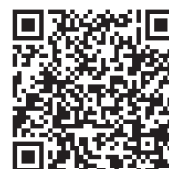
Figure 21.1 QR code referring to interactive exercises.

Access interactive exercises for this chapter 295 by positioning your smartphone camera at the dot-filled box, also known as a QR code.