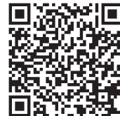
Figure 12.1 QR code referring to interactive exercises.

Access interactive exercises for this chapter 1 by positioning your smartphone camera at the dot-filled box, also known as a QR code.