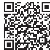
Figure 11.1 QR code referring to interactive exercises.

Access interactive exercises for this chapter 1 by positioning your smartphone camera at the dot-filled box, also known as a QR code.