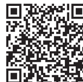
Figure 21.1 QR code referring to interactive exercises.

Access interactive exercises for this chapter 295 by positioning your smartphone camera at the dot-filled box, also known as a QR code.