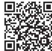
Figure 20.1 QR code referring to interactive exercises.

Access interactive exercises for this chapter 1 by positioning your smartphone camera at the dot-filled box, also known as a QR code.