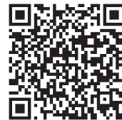
Figure 13.1 QR code referring to interactive exercises.

Access interactive exercises for this chapter 1 by positioning your smartphone camera at the dot-filled box, also known as a QR code.