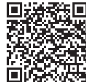
Figure 18.1 QR code referring to interactive exercises.

Access interactive exercises for this chapter 1 by positioning your smartphone camera at the dot-filled box, also known as a QR code.