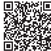
Figure 1.1 QR code referring to interactive exercises.

Access interactive exercises for this chapter 1 by positioning your smartphone camera at the dot-filled box, also known as a QR code.