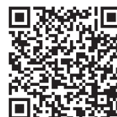
Figure 23.1 QR code referring to interactive exercises.

Access interactive exercises for this chapter 39 by positioning your smartphone camera at the dot-filled box, also known as a QR code.