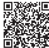
Figure 21.1 QR code referring to interactive exercises.

Access interactive exercises for this chapter 210 by positioning your smartphone camera at the dot-filled box, also known as a QR code.