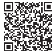
Figure 23.1 QR code referring to interactive exercises.

Access interactive exercises for this chapter 1 by positioning your smartphone camera at the dot-filled box, also known as a QR code.