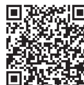
Figure 21.1 QR code referring to interactive exercises.

Access interactive exercises for this chapter 172 by positioning your smartphone camera at the dot-filled box, also known as a QR code.