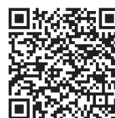
Figure 22.1 QR code referring to interactive exercises.

Access interactive exercises for this chapter 20 by positioning your smartphone camera at the dot-filled box, also known as a QR code.