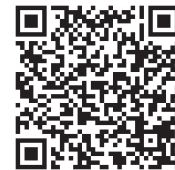
Figure 23.1 QR code referring to interactive exercises.

Access interactive exercises for this chapter 124 by positioning your smartphone camera at the dot-filled box, also known as a QR code.