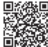
Figure 20.1 QR code referring to interactive exercises.

Access interactive exercises for this chapter 1 by positioning your smartphone camera at the dot-filled box, also known as a QR code.