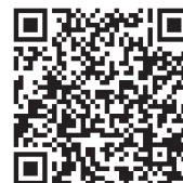
Figure 21.1 QR code referring to interactive exercises.

Access interactive exercises for this chapter 269 by positioning your smartphone camera at the dot-filled box, also known as a QR code.