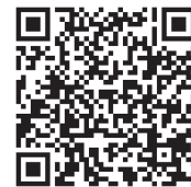
Figure 21.1 QR code referring to interactive exercises.

Access interactive exercises for this chapter 269 by positioning your smartphone camera at the dot-filled box, also known as a QR code.