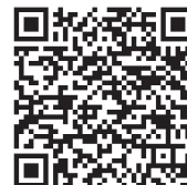
Figure 22.1 QR code referring to interactive exercises.

Access interactive exercises for this chapter 55 by positioning your smartphone camera at the dot-filled box, also known as a QR code.