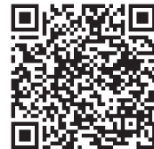
Figure 8.1 QR code referring to interactive exercises.

Access interactive exercises for this chapter 1 by positioning your smartphone camera at the dot-filled box, also known as a QR code.