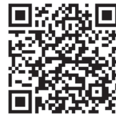
Figure 20.1 QR code referring to interactive exercises.

Access interactive exercises for this chapter 1 by positioning your smartphone camera at the dot-filled box, also known as a QR code.