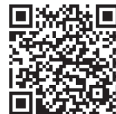
Figure 5.1 QR code referring to interactive exercises.

Access interactive exercises for this chapter 1 by positioning your smartphone camera at the dot-filled box, also known as a QR code.