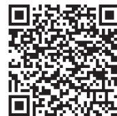
Figure 16.1 QR code referring to interactive exercises.

Access interactive exercises for this chapter 1 by positioning your smartphone camera at the dot-filled box, also known as a QR code.