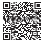
Figure 3.1 QR code referring to interactive exercises.

Access interactive exercises for this chapter 1 by positioning your smartphone camera at the dot-filled box, also known as a QR code.