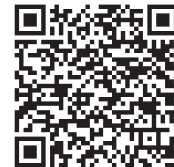
Figure 22.1 QR code referring to interactive exercises.

Access interactive exercises for this chapter 55 by positioning your smartphone camera at the dot-filled box, also known as a QR code.