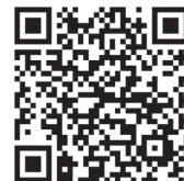
Figure 4.1 QR code referring to interactive exercises.

Access interactive exercises for this chapter 1 by positioning your smartphone camera at the dot-filled box, also known as a QR code.