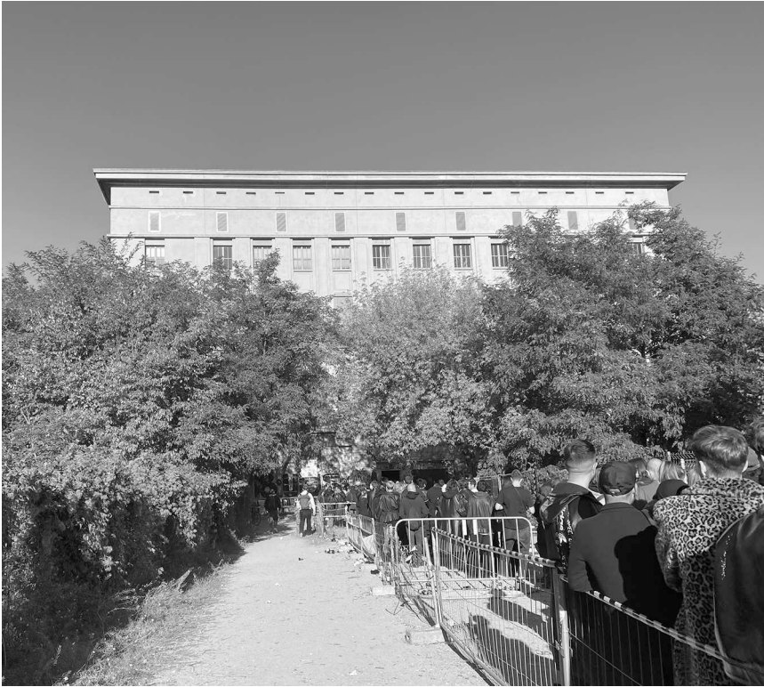
Figure 12.2 Sunday afternoon queue outside Berghain techno club, Berlin.

warehouses and powerplants, and Berlin's collective cultural memory (Assmann 2010). For example, Berlin DJs' creative production work, including their self-presentation, expresses the egalitarian, experience-oriented spirit of techno as post-cold-war folk music and counter-culture open for people from all classes (Biehl and vom Lehn 2016).