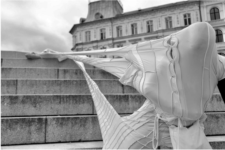
Figure 11.1 Agnes Saaby Tomsen and Charlotte Østergaard exploring surfaces of Israels Plads, Community Walk, performance festival: Walk(k)ing Copenhagen, DK.