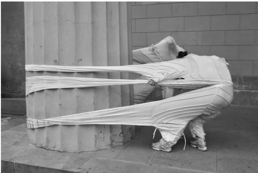
Figure 11.2 Tanya Rydell Morton and Charlotte Østergaard tangling with column in front of Vor Frue Kirke, Community Walk, performance festival: Wal(k)ing Copenhagen, DK. Screenshot from video by videographer Benjamin Skop.

In the quote above, Wearer One indirectly highlights the material and spatial dimension of the costume. For example, when leaning away from each other the connection and the distance between the wearers grew. Consequently, the costume’s stretchable material created a spatial and inter-relational sensation. The wearers’ embodied responses to the materiality and