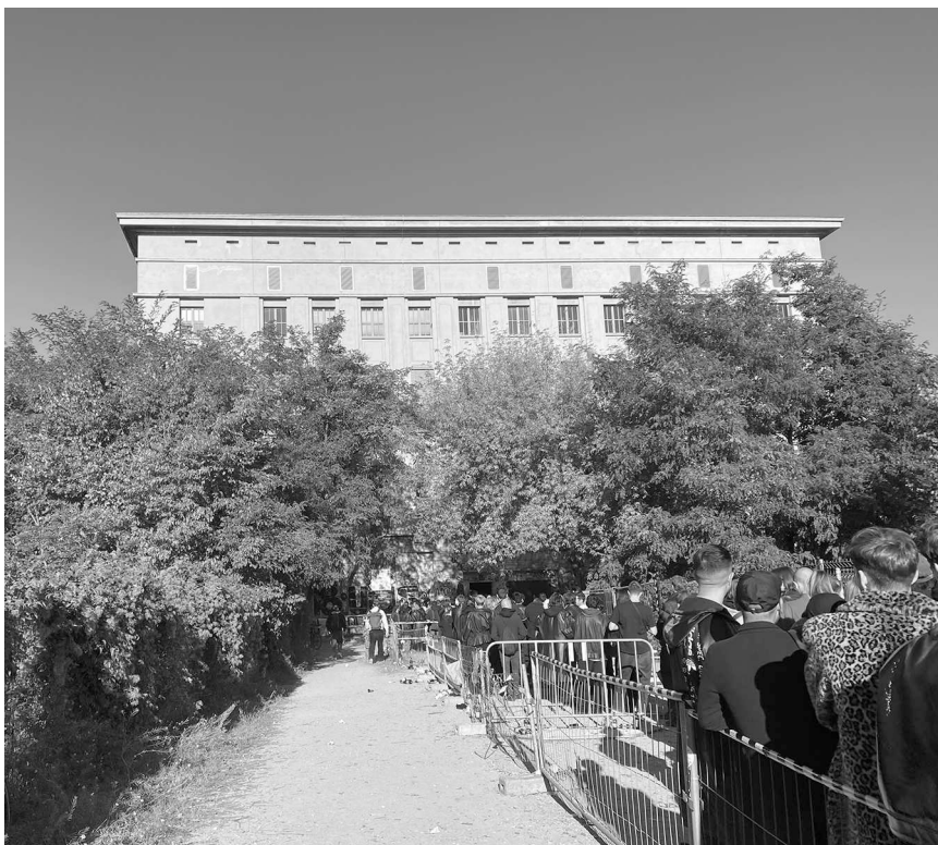
Figure 12.2 Sunday afternoon queue outside Berghain techno club, Berlin.

warehouses and powerplants, and Berlin's collective cultural memory (Assmann 2010). For example, Berlin DJs' creative production work, including their self-presentation, expresses the egalitarian, experience-oriented spirit of techno as post-cold-war folk music and counter-culture open for people from all classes (Biehl and vom Lehn 2016).