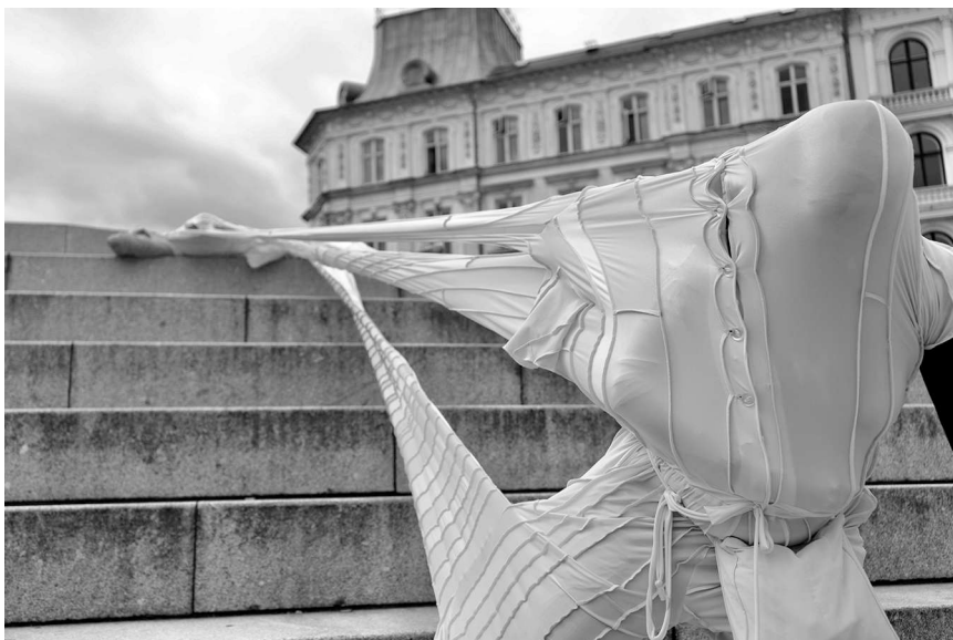
Figure 11.1 Agnes Saaby Tomsen and Charlotte Østergaard exploring surfaces of Israels Plads, Community Walk, performance festival: Walk(k)ing Copenhagen, DK.