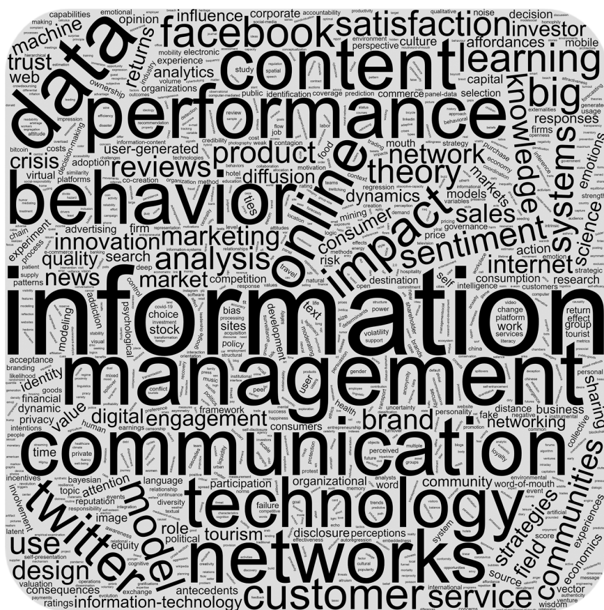
FIGURE 1 Word cloud based on all articles' keywords.