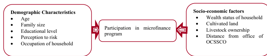
Fig. 1 Conceptual framework