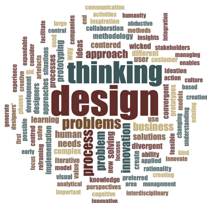
Fig. 2 Word cloud created based on word frequency

Additional file 2: Appendix B: Data analysis tab/column H and I). Table 5 shows the categories and codes generated during the data analysis process, as well as examples of the values identified (for more details, see Additional file 2: Appendix B: Value of DT tab). The numbers in brackets indicate the number of papers that include relevant data. The results show that all the papers examined explored the methodological value of design thinking for business model innovation, and 2 of them also explored design thinking as a way of thinking.