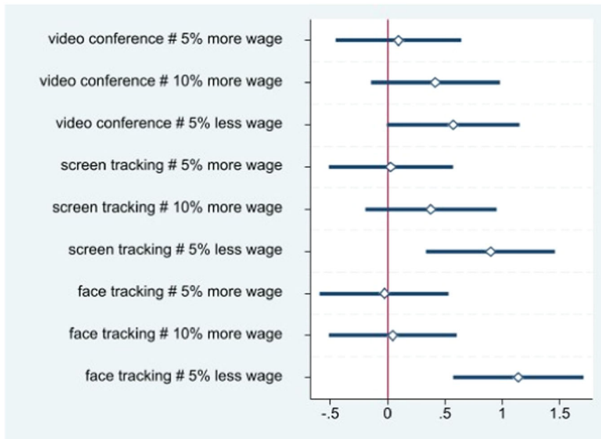
FIGURE A1 Plotted interactions of the control system and wage changes (from multilevel regression). [Color figure can be viewed at wileyonlinelibrary.com ]