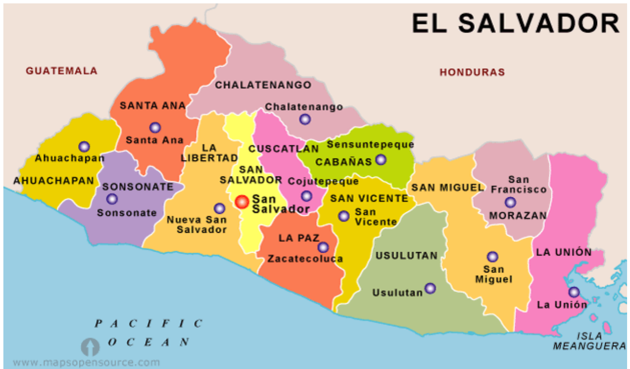
Figure 1. Map of El Salvador including all 14 departments and capitals